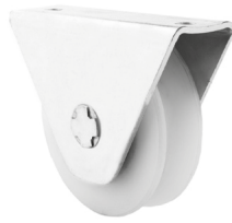
Polea nylon canal "V" 20 mm con caja Nylon wheel with box | Galet nylon en applique | Polia nylon com caixa