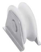
Polea nylon canal "U" 20 mm con soporte Nylon wheel to weld | Galet nylon à souder | Polia nylon com suporte