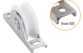
Polea nylon canal "U" 20 mm encastrar Nylon wheel to fit | Galet nylon à encastrer | Polia nylon de encastrar