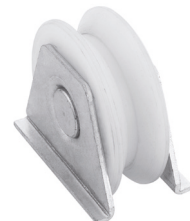
Polea nylon canal "V" 20 mm soporte Nylon wheel to weld | Galet nylon à souder | Polia nylon com suporte