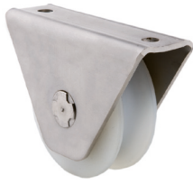
Polea nylon canal "U" 20 mm con caja Nylon wheel with box | Galet nylon en applique | Polia nylon com caixa

BOTTOM SLIDING GATES HARDWARE | FERRURES PORTES COULISSANTES AU SOL | FERRAGENS PORTAS DE CORRER